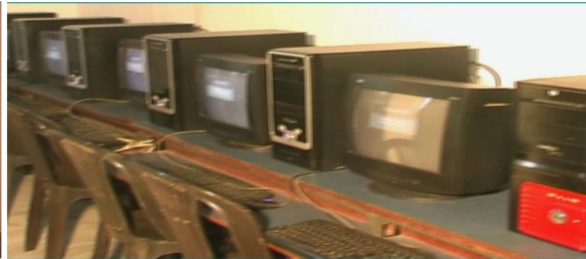
ICT Resource Centre