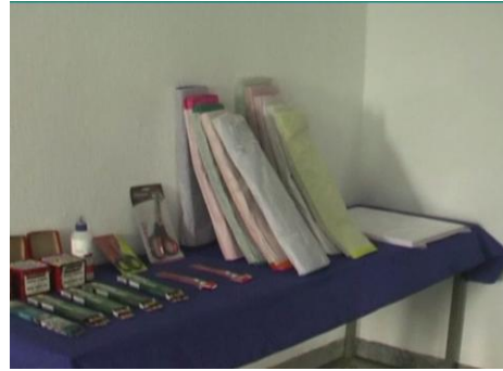
Art & Craft Resource Centre